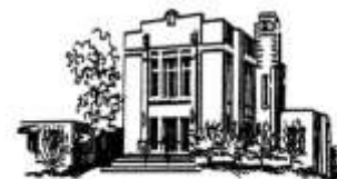
Temple Beth El