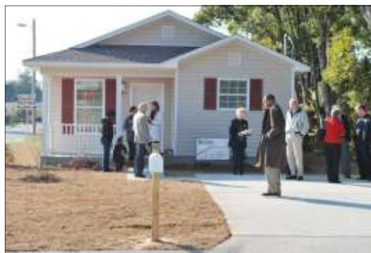
Finished house awaiting dedication.

“I never realized how my own, personal labor could make the community a better place by helping one family lead a better life.” Speaker from the Pensacola Boys Base