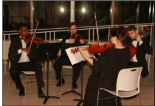
We enjoyed beautiful string music provided by UWF students during the rededication reception.