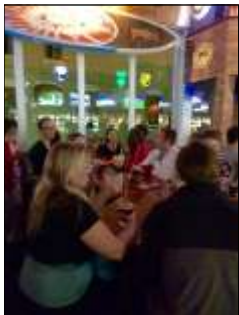
Young Jewish Pensacola social in November at World of Beer.