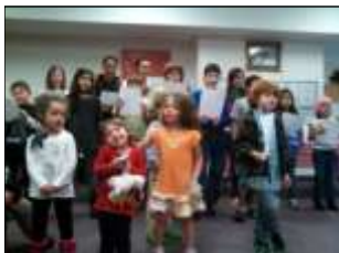
Singing and Ice Cream Social Fun for All! Children from Temple Beth El and B'nai Israel sing for residents at Wesley Haven on Dec 8. After singing the children and residents enjoyed ice cream. Program sponsored by the Pensacola Jewish Federation.