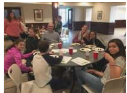
Celebrating Tu B'Shvat with a fruit Seder